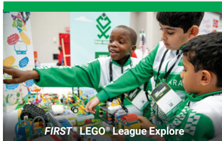
FIRST® LEGO® League Explore

In Explore, teams of students ages 6-10 focus on the fundamentals of engineering as they explore real-world problems, learn to design and code, and create unique solutions made with LEGO bricks and powered by LEGO® Education SPIKE™ Essential.