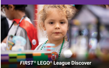
FIRST® LEGO® League Discover

For children ages 4-6, this playful introductory STEM program ignites their natural curiosity and builds their habits of learning with hands-on activities in the classroom and at home using LEGO® DUPLO® bricks.